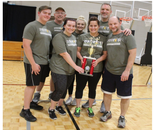
Runner Up: Shiloh Baptist