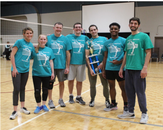
1st Place Winner: Judson Baptist

In the fall of 2019, 4 teams participated in the coed league that played at Judson Baptist Church