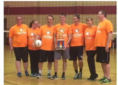
First place: Judson Baptist

In the fall of 2016, 14 teams participated in the coed volleyball season. Teams played at Judson Baptist Church and Tulip Grove Baptist Church. Judson won first place in this year's championship, and Tulip Grove won second place.