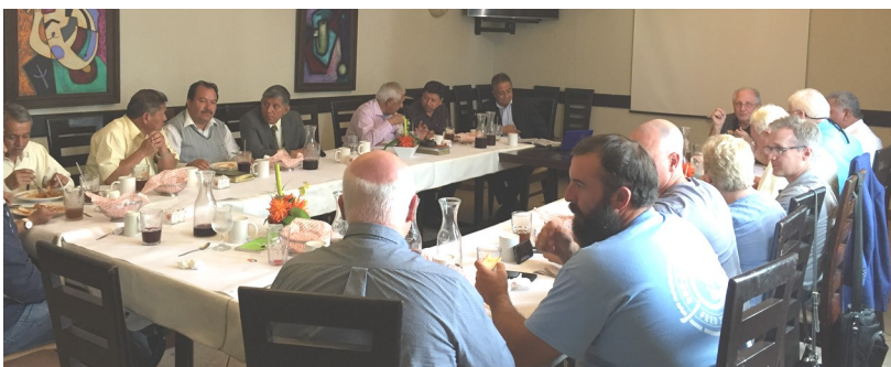
Planning with Guatemala Pastors