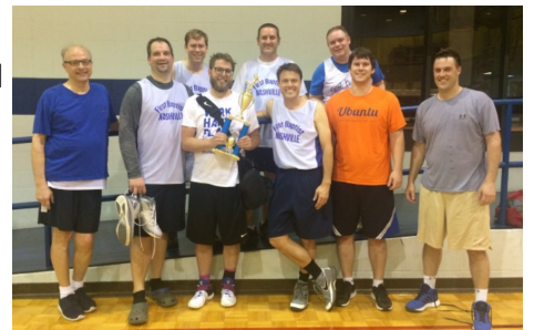
First place: Creievwood Baptist

During the winter, five churches participated in the NBA Coed Basketball League. Creievwood Baptist Church was the champion for 2017, and Nashville First Baptist was the runner-up.